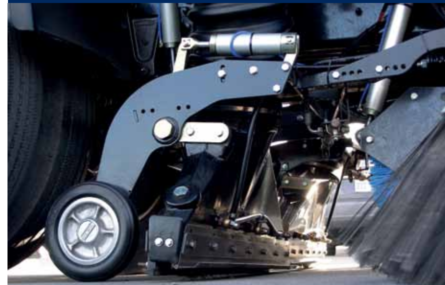
BELOW Optional full-width nozzle option between the axles.