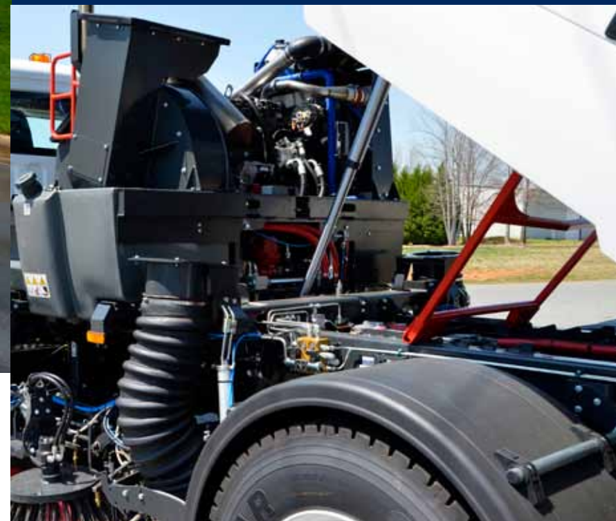
ABOVE Stainless steel hydraulic lines, wider blower intakes, and new improved body safety prop automatically deploys.

The Johnston V Range is robustly constructed from quality materials and designed to provide years of continuous performance and reliable service. End of life disposal is enhanced by the V Range sweeper being almost 100% recyclable.