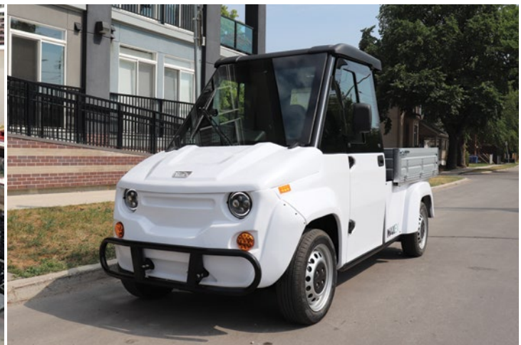
WHITE MAX-EV WITH NERF BAR & CLAMPING WALLS