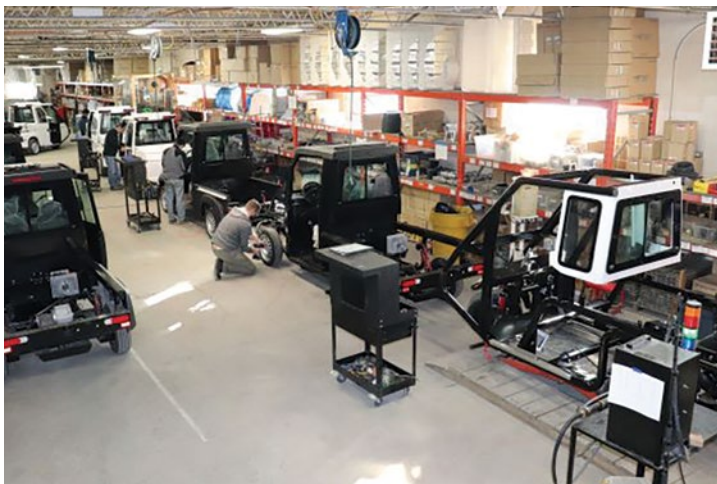
BUILDING LITHIUM ION EVS SINCE 2014

**Total Payload includes allocation for operators. MAX 15-20 have reduced payloads due to max GVWR LSV class of 3000lbs. Payloads are based on a base vehicle, no options.