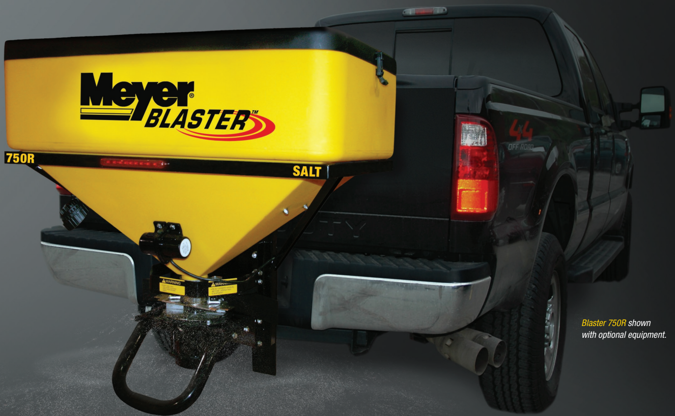
Blaster 750R shown with optional equipment.