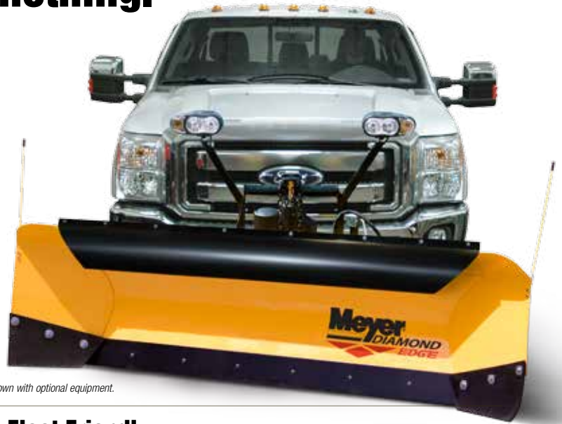
Shown with optional equipment.

The Meyer Diamond Edge can also be attached using the time-tested EZ-Mount® Classic™ mounting system.