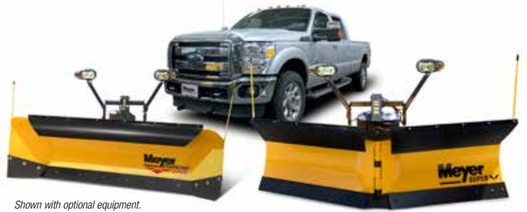
Shown with optional equipment.

The EZ-Mount Plus mounting system is Fleet Friendly because the moldboards and controllers are interchangeable.