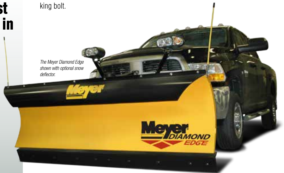
The Meyer Diamond Edge shown with optional snow deflector.

Meyer Diamond Edge plows come standard with a reversible center hole punched cutting edge for longer wear life.