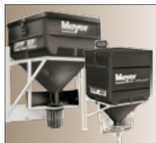
In 1999 black thermoplastic replaced fiberglass on the hopper.