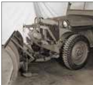
Designed the first plow for 4-wheel drive vehicles.