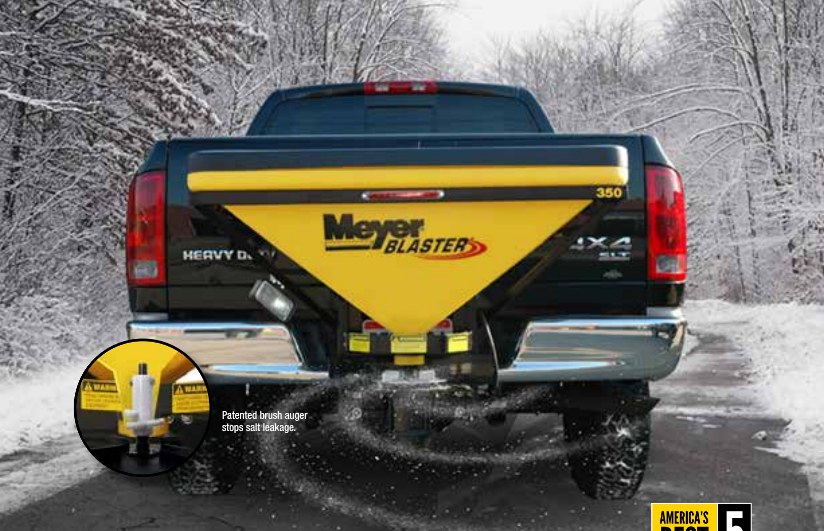
Patented brush auger stops salt leakage.