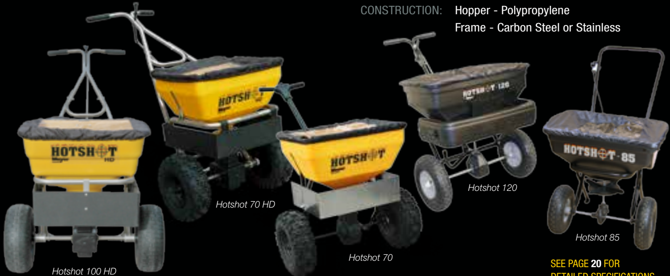
Hotshot 100 HD