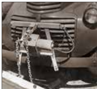
Developed the T-1 Electric Hydraulic Lift, the first ever.