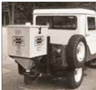
In 1972 the Meyer "Mini Spreader" was introduced. The perfect size to control ice where the big trucks couldn't.