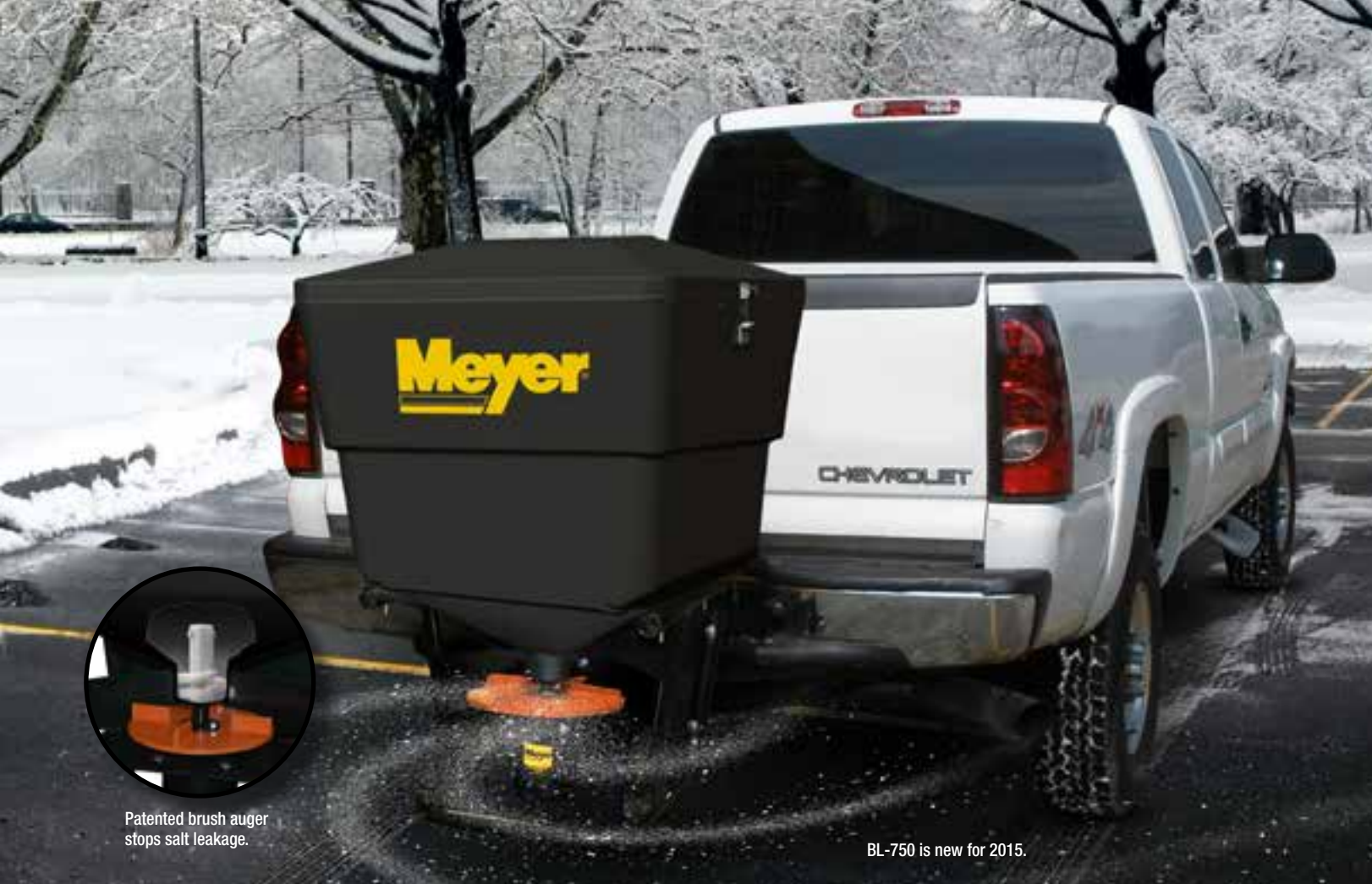
Patented brush auger stops salt leakage.