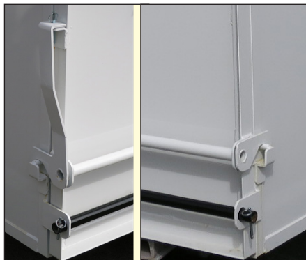
Easy to open and close latch mechanism makes closing the door simple and virtually effortless.

Primed with a rust inhibitor primer and painted with two coats of automotive quality paint. White is standard, other paint colors available as an option.