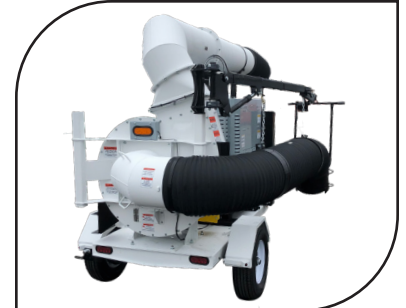
*Specifications subject to change at any time without notice.

Sourcewell Awarded Contract Contract # 031121-ODB