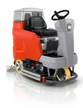
Scrubmaster B120 R Available Sizes (4)