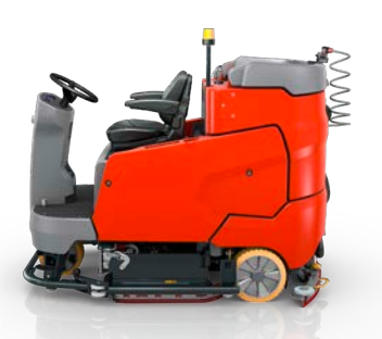
Efficient Design The Scrubmaster B260 R offers upfront operator visibility and operator on/off access on either side of the machine