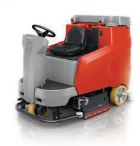
Scrubmaster B260 R